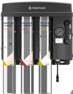
EZ-RO 650/50ATM wall mount